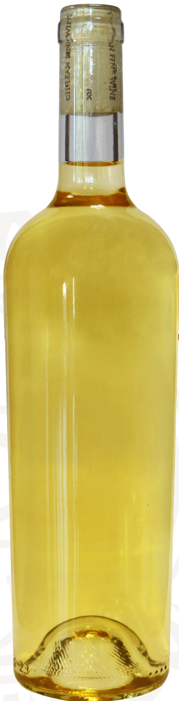
Cónica Blanca Bottle